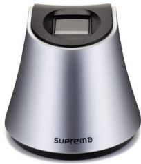
BioMini Front View