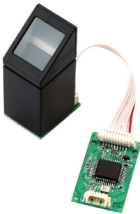
SFU500 (OEM version)