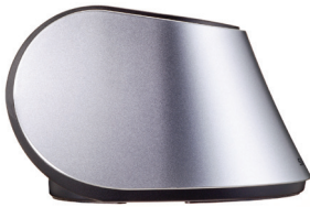
BioMini Side View